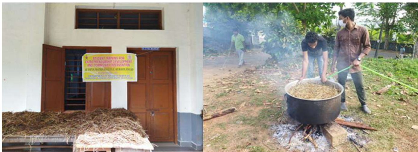
Students involved in the training of mushroom cultivation