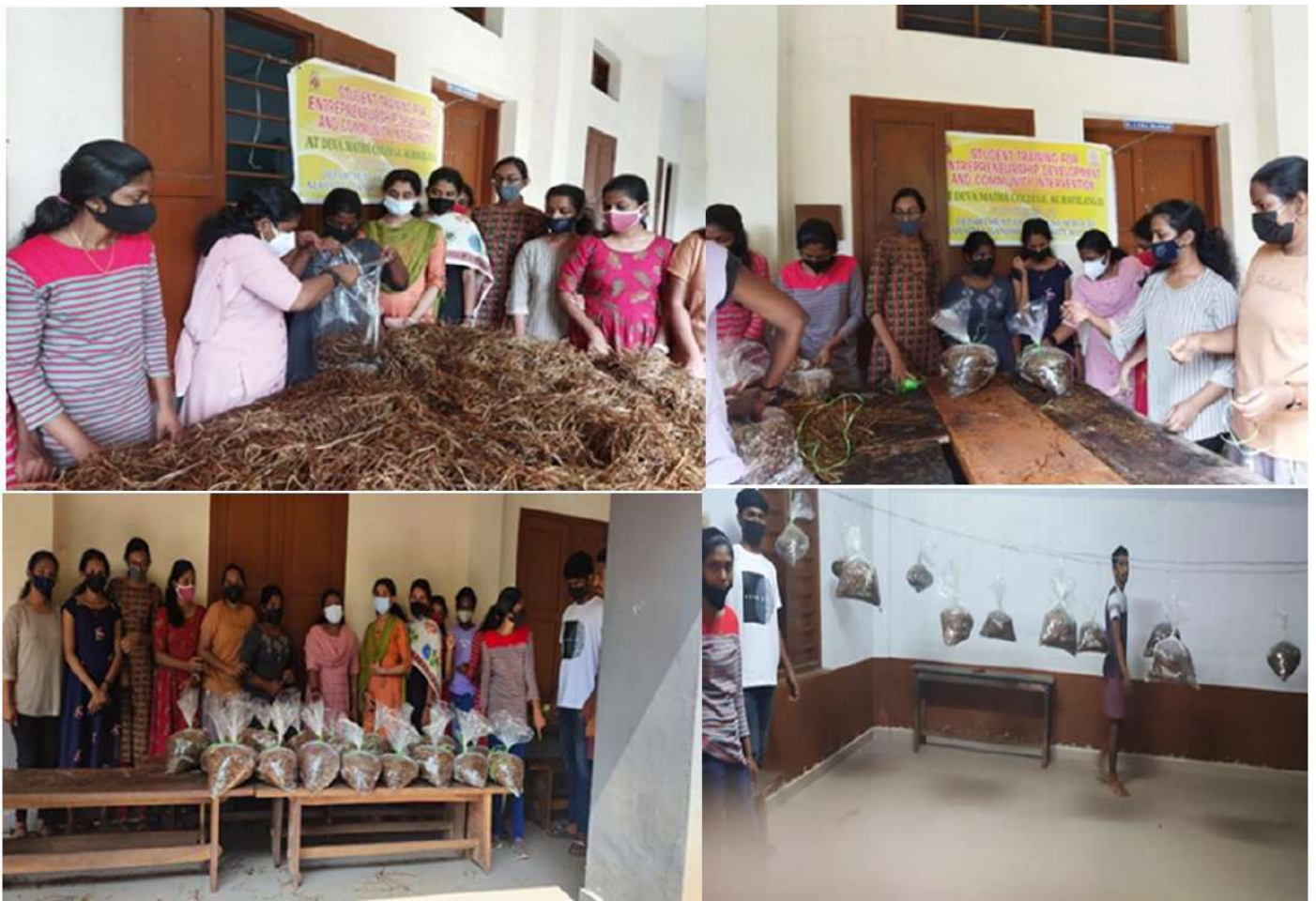
Students involved in the training of mushroom cultivation