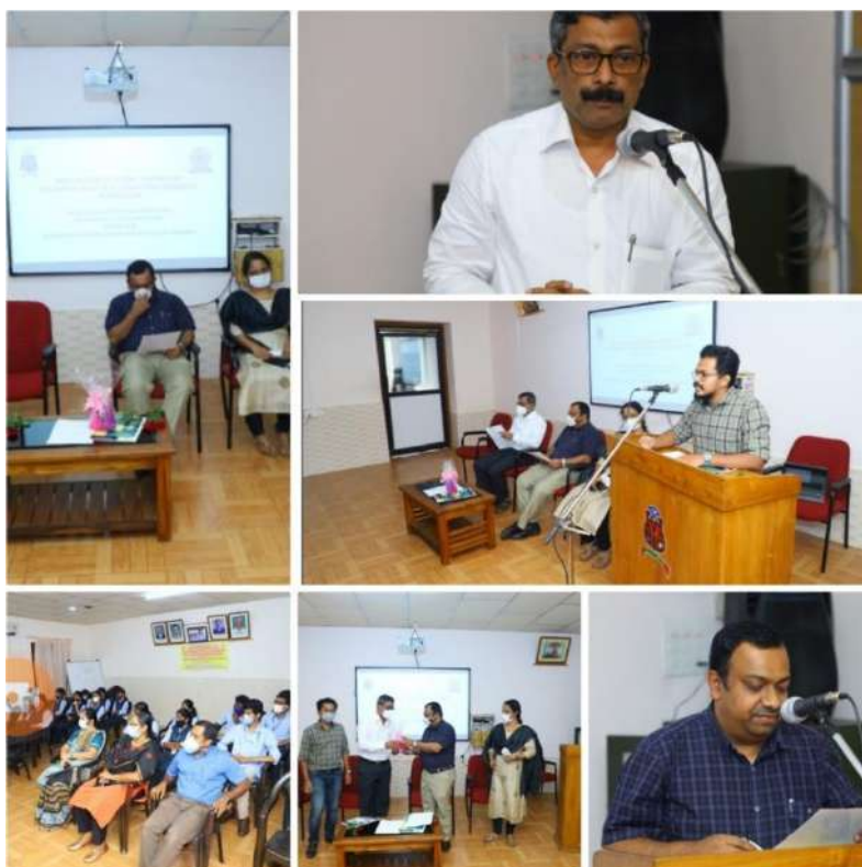
Inauguration of the training programme.