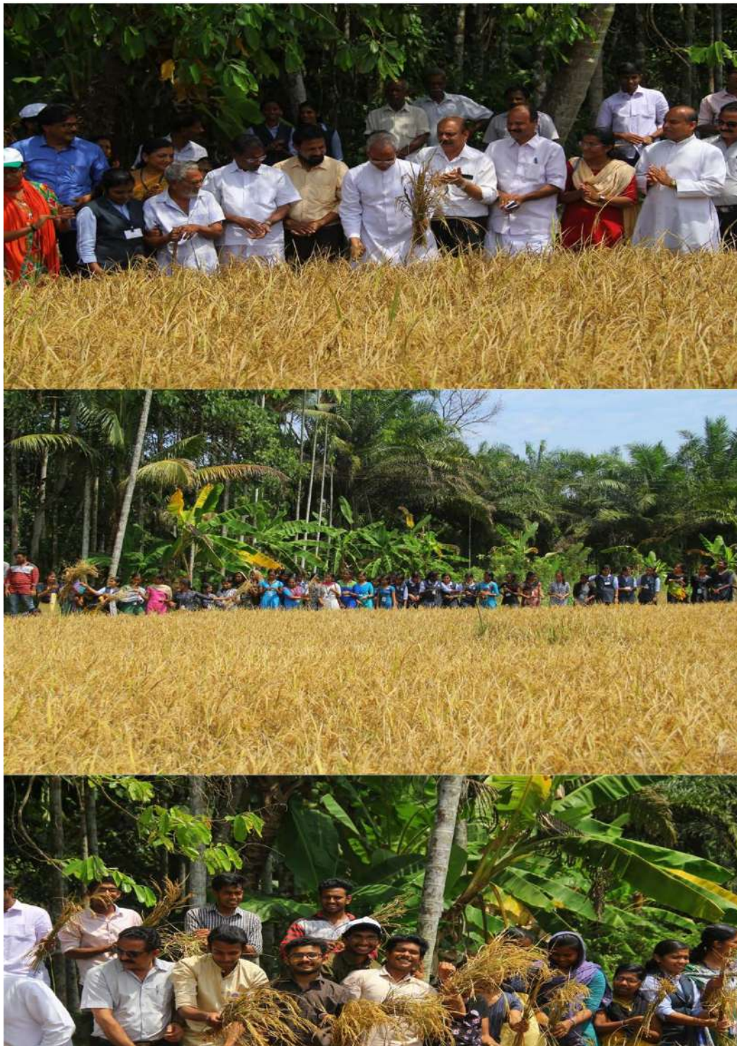
Harvest on 27 February 2018