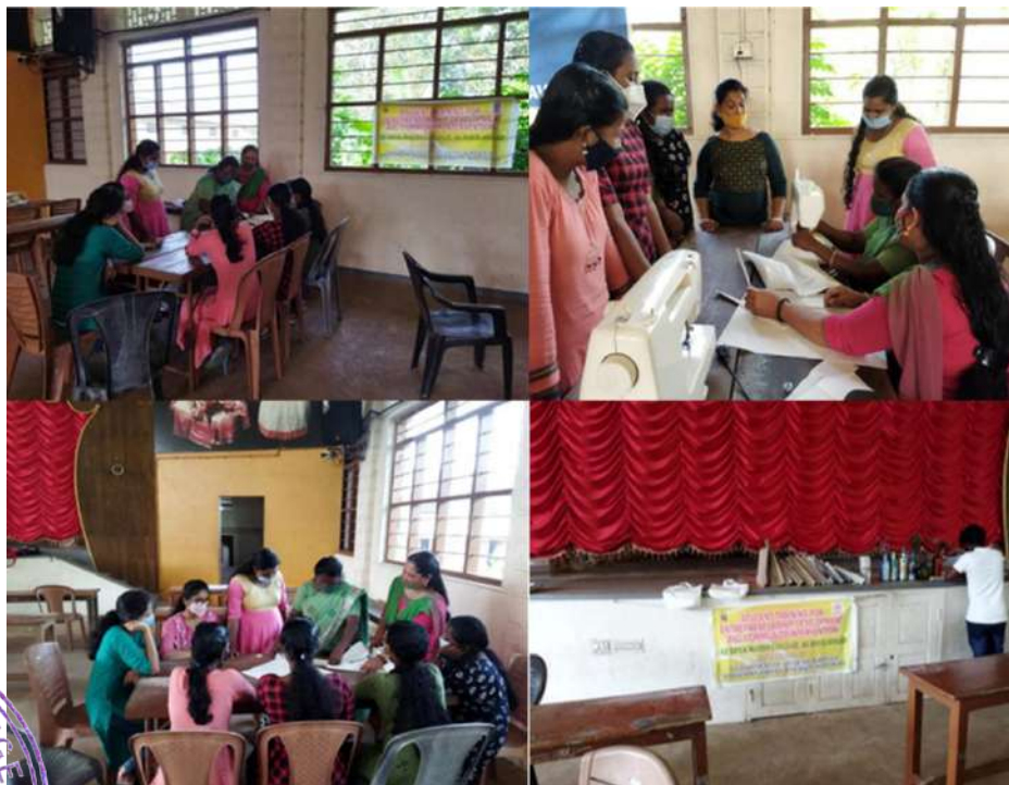
Students involved in the training of cloth bag making

The forenoon session of the third day (29/12/21) was on cloth bag making. Resource persons were from the Pala Social Service Society. Initially, the students have given a theory session on the topic ‘Go Green’, followed by a practical session where students learned to stitch cloth bags.