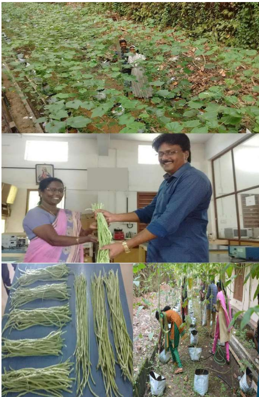
Organic vegetable garden & its harvest

Our unit undertook vegetable cultivation on the campus in an organic way. We had an excellent harvest. Only organic manure like cow dung and Jeevaamrutham, and organic pesticides like neem oil were used for the cultivation.