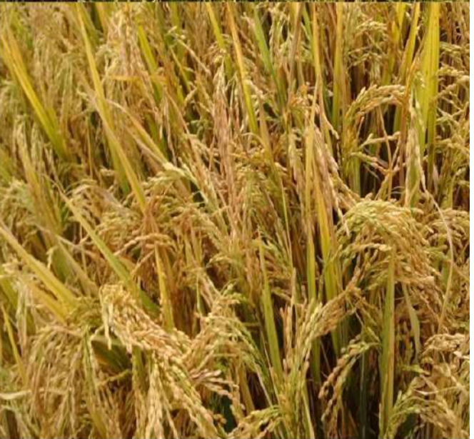
Various stages of cultivation