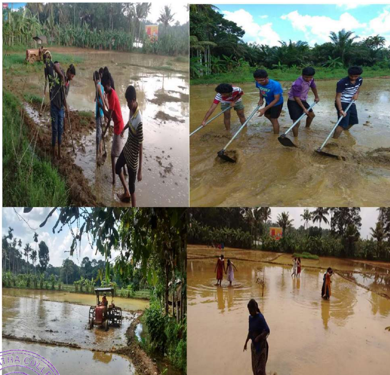
Preparing land for cultivation

The year's most important and prestigious activity was the fallow land paddy cultivation the unit undertook on two acres. The paddy field had been laid barren for the last twenty years. We reclaimed the land and cultivated paddy with the assistance of the agricultural department. Our volunteers got a first-hand experience with paddy cultivation. From preparing the land to harvest, they witnessed various stages involved in the cultivation of paddy. We consider it an outstanding achievement. The percentage of paddy cultivation is becoming less and less every year, and the people of Kerala depend more and more on other states for their staple food. We believe that our fallow land cultivation has given our students positive experiences and examples that would call their attention to this serious problem.