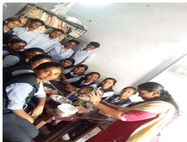
Photos of cake baking session